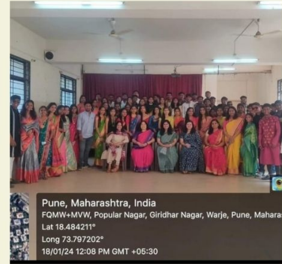
Pune, Maharashtra, India FQMW+MVW, Popular Nagar, Giridhar Nagar, Warje, Pune, Mahara Lat 18.484211° Long 73.797202° 18/01/24 12:08 PM GMT +05:30