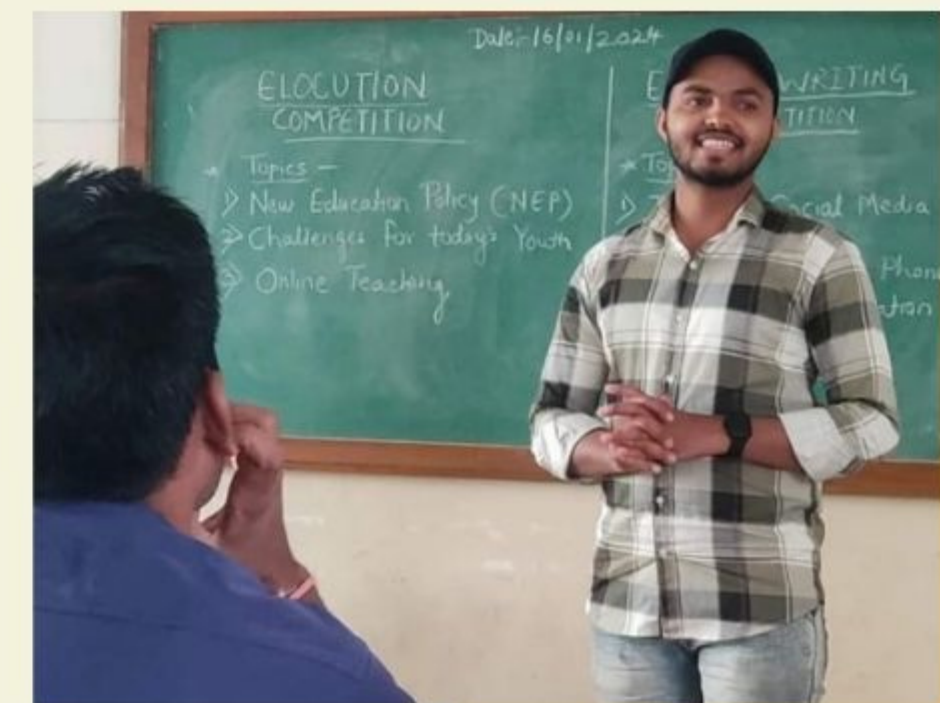
Pune, Maharashtra, India Block-B6, PAPULAR NAGAR, Popular Nagar, Giridhar Nagar, Warje, Pune, Maharashtra 4 India Lat 18.484061°