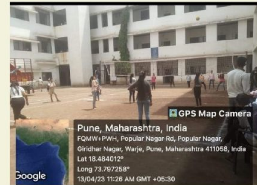
Pune, Maharashtra, India FQMW+PWH, Popular Nagar Rd, Popular Nagar, Giridhar Nagar, Warje, Pune, Maharashtra 411058, India Lat 18.484012° Long 73.797258° 13/04/23 11:26 AM GMT +05:30